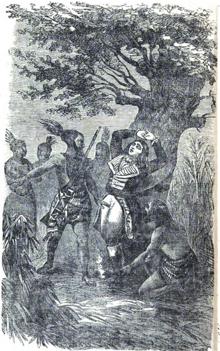
THE INDIAN MASON.